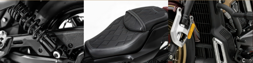
Standard equipment: TCS, ABS brakes, Full LED lights/indicators, Front camera, USB, color LCD display, Bar-end mirrors.