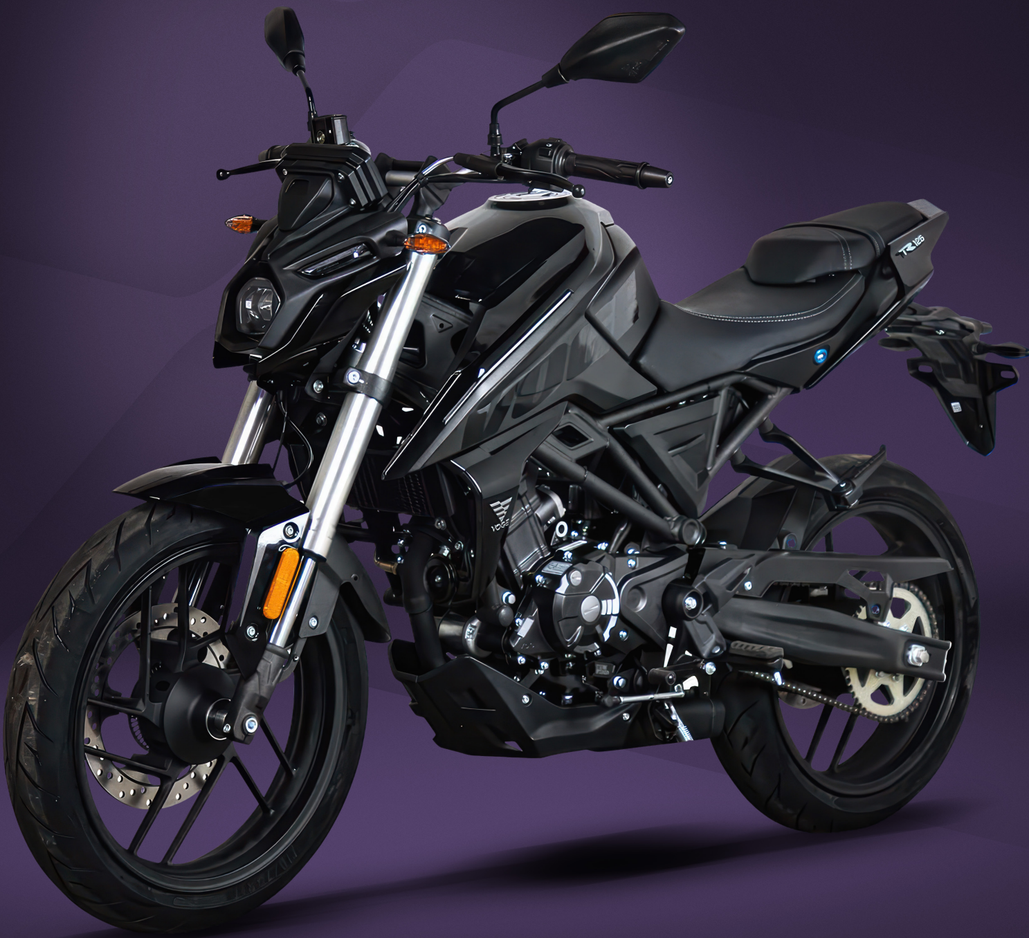
Standard equipment: ABS brakes, Upside-down front fork, Full LED lights/indicators, LED colour display.